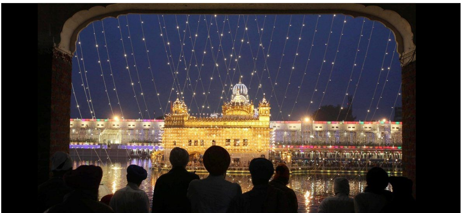
Celebrations have taken place in India and Pakistan to mark the 550th anniversary of the birth of Guru Nanak - the founder of Sikhism. The Golden Temple in Amritsar, in north-western India, is the holiest Gurdwara (where Sikhs worship). On the eve of the anniversary, it was lit up to host processions as Sikh worshippers took part in the three-day celebration of Guru Nanak's birth.